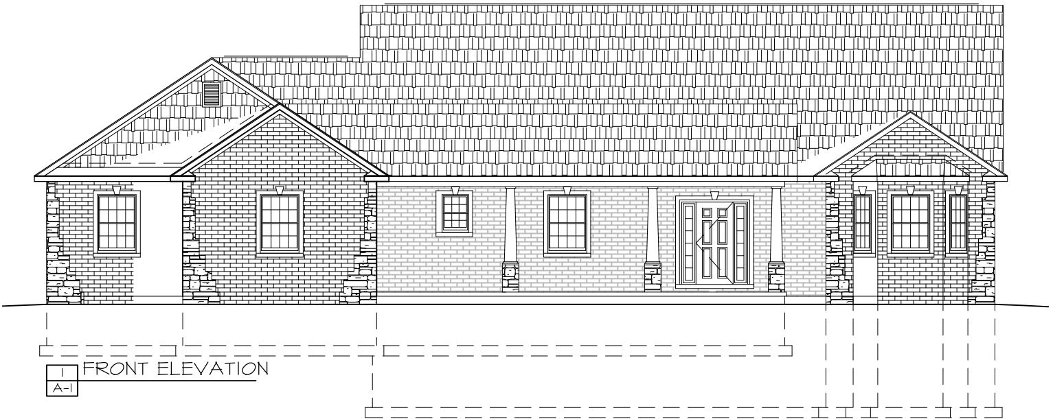
FRONT ELEVATION A-1